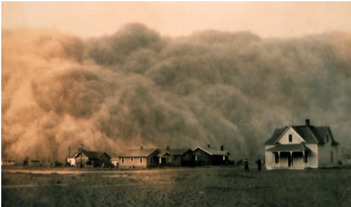
Image 4: A dust storm approaches Stratford, Texas, in 1935.

Starting with questions about the object of study—what is environmental history?—and introducing students to debates like the naming of the Anthropocene or how different communities approach environmental restoration projects invites students to think about history differently from the beginning of the course. To introduce students to the debate over the Anthropocene invites students to reconsider their own relationship to nature and the concept of nature. This debate also gets students thinking about doing history from the point of view of this particular moment in time, and the differences between historical and geological (or ecological) time. Viewing historical developments through a prism that emphasizes economic and environmental factors can lead students to identify different “turning points,” thus challenging a periodization based on European political history. When tackling these difficult concepts, it can be helpful to combine different kinds of sources. When considering the question of the Anthropocene—what is it? has it started? if so, when?—this might mean pairing a Guardian Audio Longread podcast with a short selection from a readable monograph. 9 Using popular sources can introduce students to accessible material as well as to journals, newspapers, and magazines they might continue to use; it has the added benefit of highlighting the current relevance of these issues.