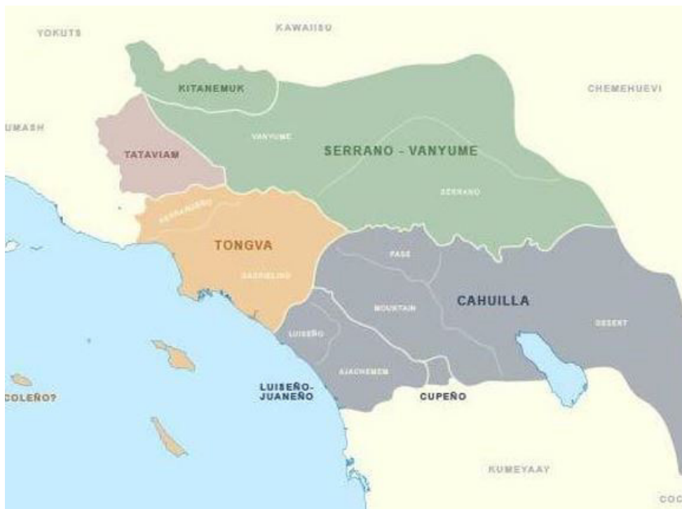
Image 1: Historical extent of various languages and dialects of the Takic branch of the Uto-Aztecan language family, including the Tongva in the Los Angeles basin and Southern Channel Islands. Source: Noahedits, used under CC BY-SA 4.0 license at https://commons.wikimedia.org/w/index.php?curid=84845562 .

The study of history, environmental history in particular, demands attention to place. Our courses are dedicated to thinking about representation and power, including racism, slavery, and settler colonialism in all of their many forms. We thus begin this essay as we begin our courses, by acknowledging that our university, Loyola Marymount University, sits on the traditional, ancestral, and unceded lands of the Gabrielino/Tongva peoples. Spain, Mexico, and the United States stole their land and attempted in different ways to erase them, but they have resisted and survived—and continue to do so. It is important that we recognize that we continue to benefit from that theft and even from the erasure of that theft from historical narratives, that we do what we can to understand the dynamics of settler colonialism, that we work for justice, and that we acknowledge the Gabrielino/Tongva as the past and present custodians of the lands that make up this place, Tovaangar (the Los Angeles basin and the Southern Channel Islands).