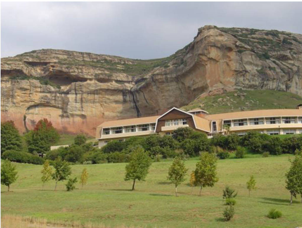
Image 3: Many modern relationships to “nature” involve complex colonial legacies. Golden Gate Hotel in the Golden Gate Highlands National Park, South Africa.

In response to such developments, and inspired by efforts at other universities to re-think the survey course, in particular the University of Michigan's development of a History 101 course, we have reframed our introductory survey courses in European and world history to focus first and foremost on introducing students to historical and historiographical thinking—that is, to the work that historians do. 8 This reframing has meant