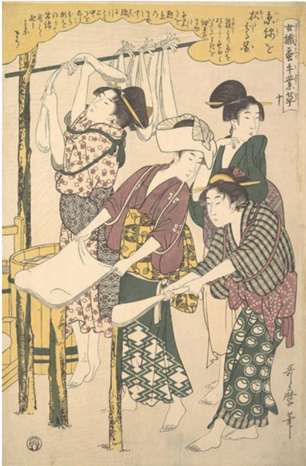
Image 6: Kitagawa Utamaro, “The Making of Silk Floss.” Woodcut, c. 1790. Source: Metropolitan Museum of Art, Howard Mansfield Collection. In the Public Domain at https://commons.wikimedia.org/wiki/File:%E5%A5%B3%E7%B9%94%E8%9A%95%E6%89%8B%E6%A5%AD%E8%8D%89_%E5%8D%81-The_Making_of_Silk_Floss_MET_DP141293.jpg .

possibilities for primary sources and allows students to see environmental history beyond the history of “pristine wilderness” or even human-nature interactions; this approach assumes that all human societies are necessarily related to the use of natural resources and human choices around their interactions with natural systems. Even considering the relationship between economic and environmental history helps students to look at both in a new way. How are they different? How are they related? Given this approach, and given the lack of global environmental history readers, using a social history reader can be eye-opening. 19 While at first students may struggle to analyze primary sources that rarely if ever explicitly address “environmental” issues, most come to see how sources from around the world since the fifteenth century consistently discuss resources, agriculture, distribution, wealth, technology, and power—all key factors in environmental history. Discovering the Global Past , for instance, includes sources that present a variety of approaches to trade, consider village restrictions on the use of natural resources, show different systems of taxation, and illustrate